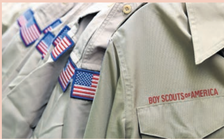
In this Feb. 18, 2020, file photo, Boy Scouts of America uniforms are displayed in the retail store at the headquarters for the French Creek Council of the Boy Scouts of America in Summit Township, Pa.

At least through June 8, an injunction issued by the bankruptcy judge, Laurie Selber Silverstein, blocks the lawyers from proceeding with lawsuits against the local councils. But several lawyers said they will press for the injunction to be lifted unless the councils' financial information is fully disclosed and they